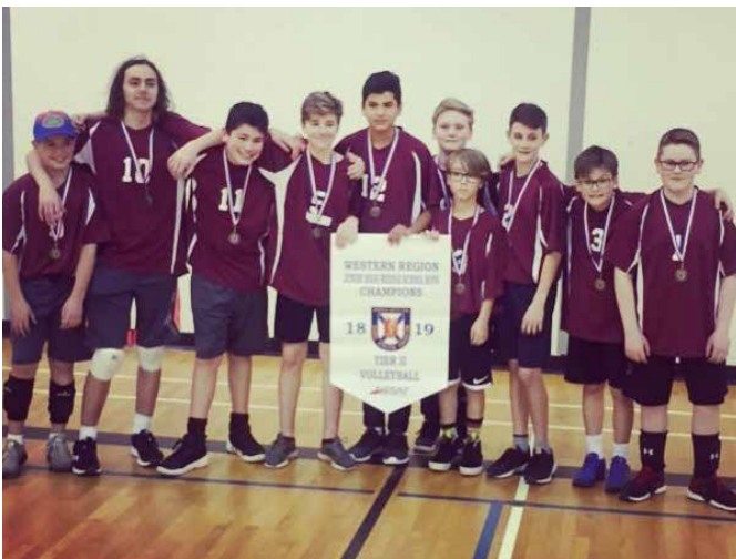
These Vikings just won the Junior Boy's Tier 2 Volleyball Western Region Championship