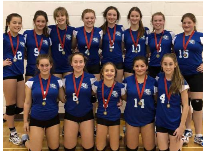
Congratulations to the Bluenose Academy Tier 1 girls volleyball team on being District Champs and Western Region Girl Volleyball Champs