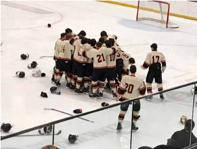
Congrats to the PVEC Division 1 Boy's Hockey Team who won the 16th Annual Glen Murray Invitational High School Hockey Tournament