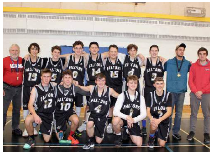
Congratulations to our Falcons boys basketball team as they captured the gold at the FHCS Early Bird Basketball Tournament