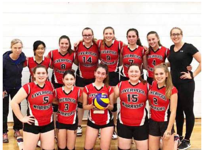
Congrats to the LRHS Warriors girls volleyball team for placing 3rd in their pool at Regionals