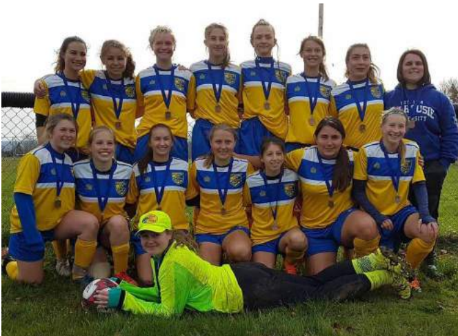
Congrats to New Germany Rural High School Senior Girls Soccer team for getting 3rd place at Provincials