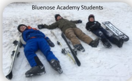
Bluenose Academy Students