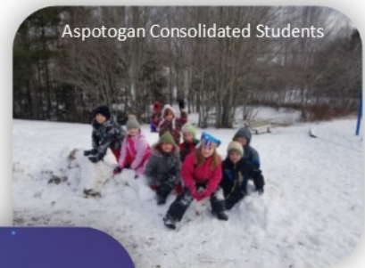
Aspotogan Consolidated Students