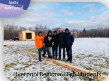
Liverpool Regional High Students