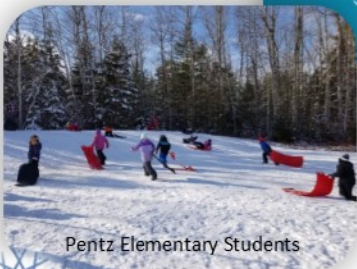
Pentz Elementary Students