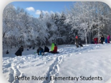
Petite Riviere Elementary Students