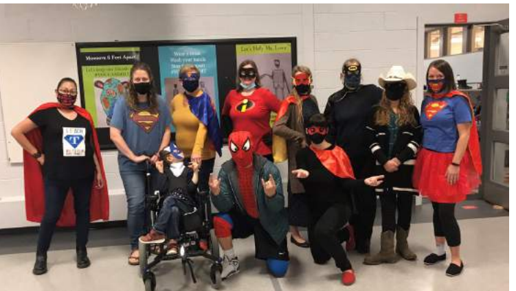
Superheroes don't only wear capes - they wear masks too! Superhero day at Petite Riviere Elementary School (above).