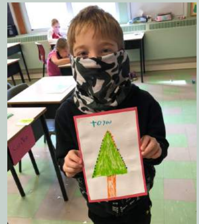
A student from Hebbville Academy shows a Christmas card he created to send to a Canadian Armed Forces member.