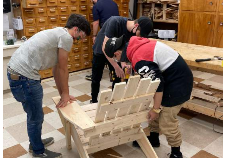
New Germany Regional High School Construction Tech 10 students test out their newly constructed Adirondack chairs!