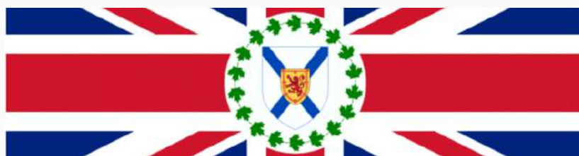
Photo of the Lieutenant-Governor Of Nova Scotia flag.

Nominations for the 2021 Lieutenant Governor's Respectful Citizenship Award are extended to May 25, 2021. This award recognizes students who've developed a project or activity that shows leadership and dedication to creating safe and inclusive spaces.