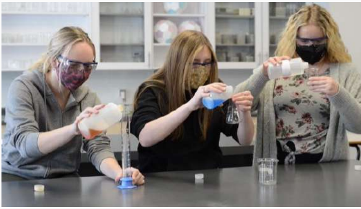
IB students at Park View Education Centre.