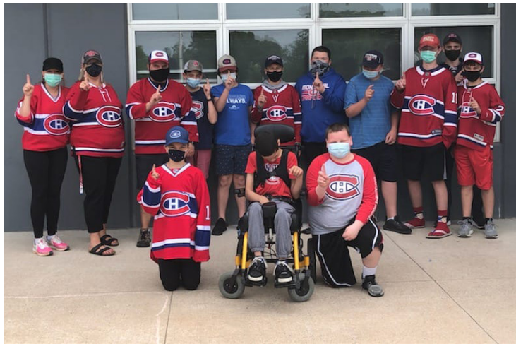
Staff and students at South Queens Middle School show their support for their favourite hockey team!