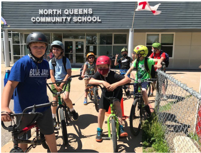
A bike rally to celebrate wrapping up another successful school year at North Queens Community School.