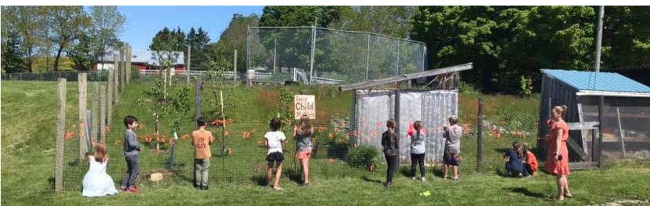
Petite Riviere Elementary School hung 215 orange ribbons to honour the 215 children whose lives were taken at the former Kamloops residential school.