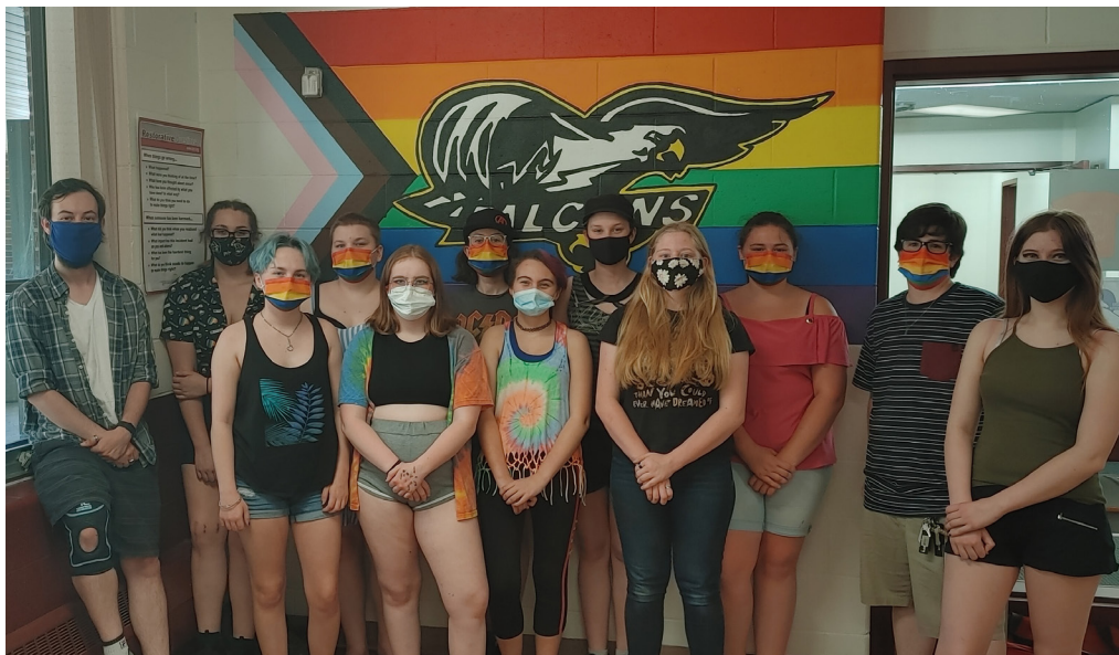
The Gender/Sexuality Alliance at Forest Heights Community School, which received the 2021 Lieutenant Governor's Award.

"They also showed leadership beyond their school, and reached out into the larger community of the Municipality of Chester and were able to lobby for change."