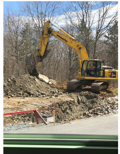
Breaking ground at Liverpool Regional High School's new skilled trade centre.

Skilled Trades courses are designed to be taught by certified journeypeople. Students receive apprenticeship hours upon registration, based on the actual class time while under the supervision of a certified journeyperson teacher.