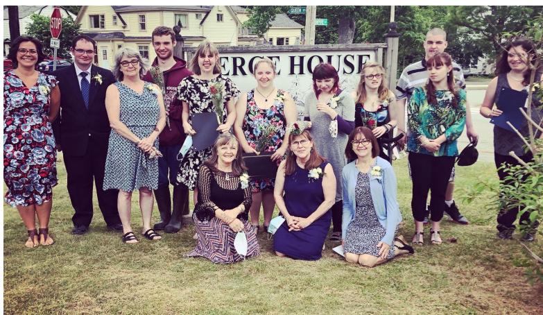
The 2021 graduates from the Verge House Transition Program. Congratulations!