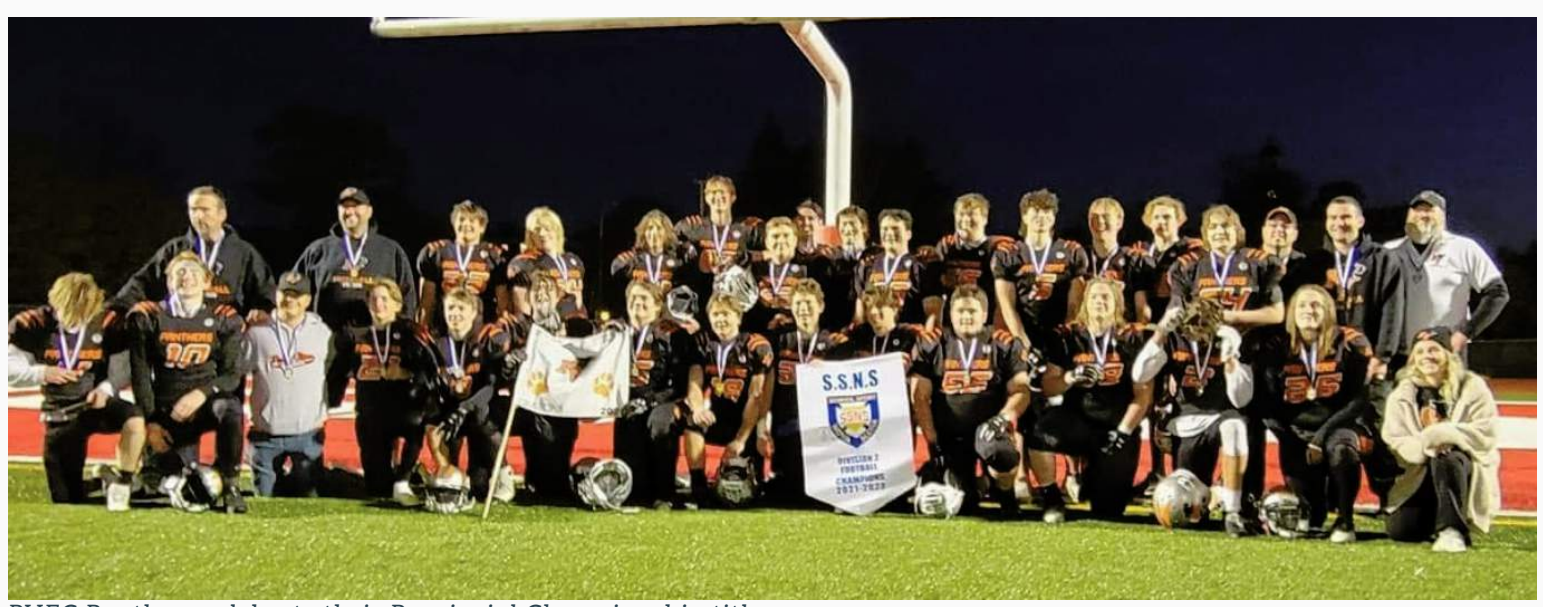
PVEC Panthers celebrate their Provincial Championship title.