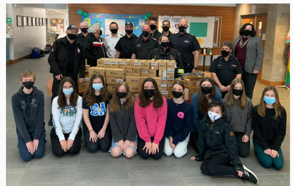
The Lunenburg, Riverport and Dayspring Fire Departments visited Bluenose Academy with a delivery of smoke detectors.

We are pleased to share some very impressive results from the 2021 Terry Fox School Run. This past September, twenty schools in SSRCE participated in the fundraiser and together collected an outstanding $17,336.6 for cancer research.