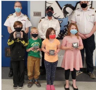
The LaHave & District Volunteer Fire Department, Cherry Hill Fun Run (United Communities Volunteer Fire Department) joined the Petite Riviere Volunteer Fire Department and provided smoke detectors to the students of Petite Riviere Elementary School.