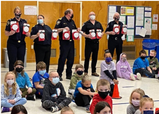
The Hebbville, Italy Cross, and Hebb's Cross Fire Departments provided smoke detectors to each student at Hebbville Academy (grades P-4).