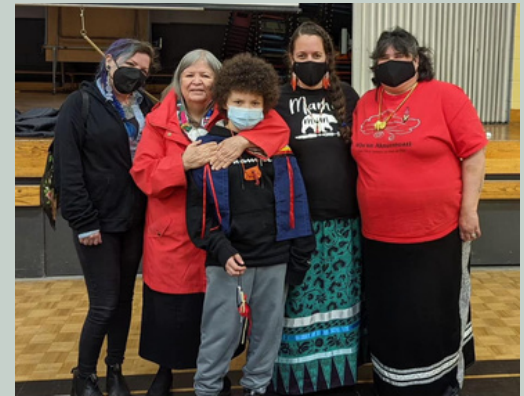
Staff at North Queens Community School received a variety of Mi'kmaq teachings during a recent Professional Development Day.