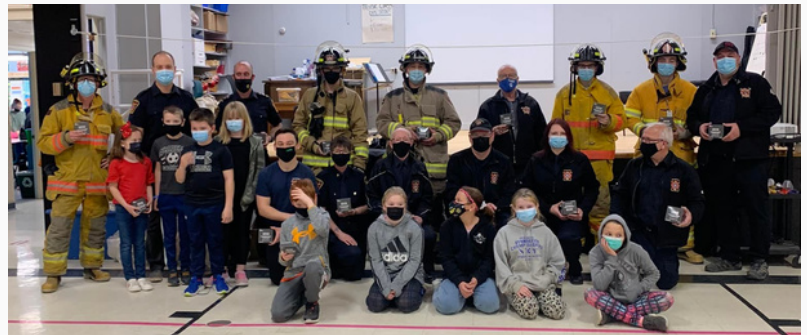
The Tri District Fire Rescue and Midville Fire Department visited Newcombville Elementary.

Here's a sample of just some of the schools who have received smoke detectors.