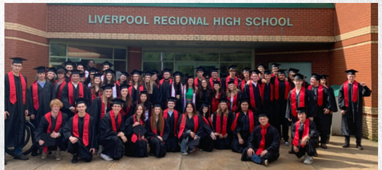
The graduates of LRHS, just one of the many SSRCE graduating classes of '23!