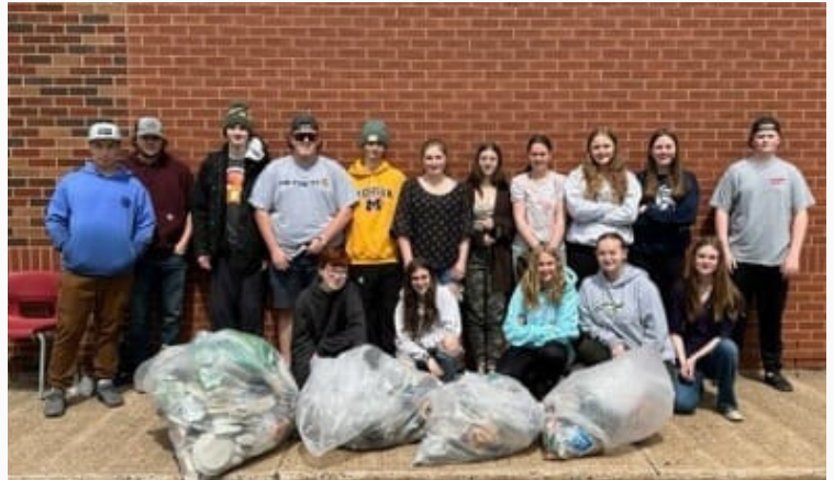
Thanks to Forest Heights Community School Grade 10 O2 students who cleaned up the school grounds for Earth day (pictured above).