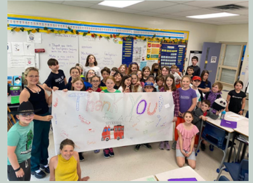
The grade four and five students at ACES display a thank you banner (above) and cards (below) that they created for firefighters as a thank you for all of their bravery and hard work.