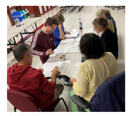
BJHS staff work collaboratively to grade student writing samples during CLT time.

All schools throughout the region have been working on supporting students, meeting them where they are and maintaining high expectations for all. Elementary schools are starting that work through