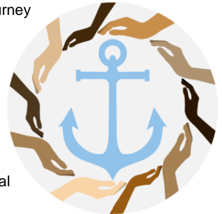
The Regional Student Advisory Council logo, designed by the student members.