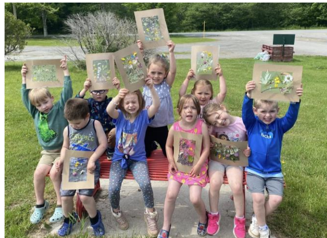
The pre-primary class at Greenfield Elementary School show their nature inspired artwork.

Children turning 4 years of age on or before December 31, 2025, are eligible to attend for the 2025-2026 school year. If your child will be attending in September 2025 and you have not yet registered, please do so either in-person at the school they will be attending or online at www.ssrce.ca/register .