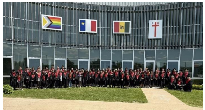
The graduating class of 2025 at Liverpool Regional High School.