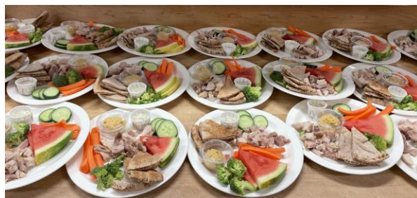
Samples of SSRCE School Lunch Program meals.

Throughout SSRCE, we are proud to provide high quality, nutritious lunches in our cafeterias. We follow a model that includes fully self-operated services, where all food is prepared from scratch and made on site at our schools by our wonderful Food Service Workers. A lot of care goes into the preparation of food in our region, and staff love to see the smiles on the faces of students when they enjoy a healthy lunch. A major goal of the NS School Lunch Program in SSRCE is to provide all students with lunch that is nutritious and delicious so that they can focus on learning and achieving. Students are enjoying the opportunity to try new foods, enjoy old favourites, and to eat with friends and classmates. This school year the menu has expanded based on student, staff, and family feedback to include more highly requested recipes. Some big hits include picnic plates, roast chicken dinner, sweet and sour meatballs, and of course, tacos!